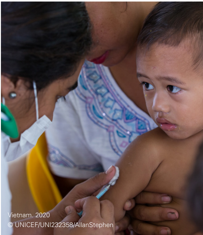
Vietnam. 2020